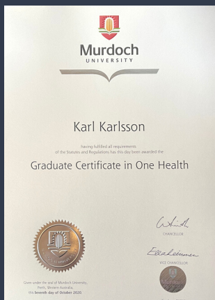
One Health Murdoch University, Australia