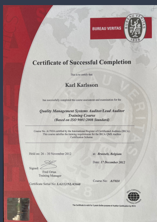
QMS Auditor ISO9001, Bureau Veritas